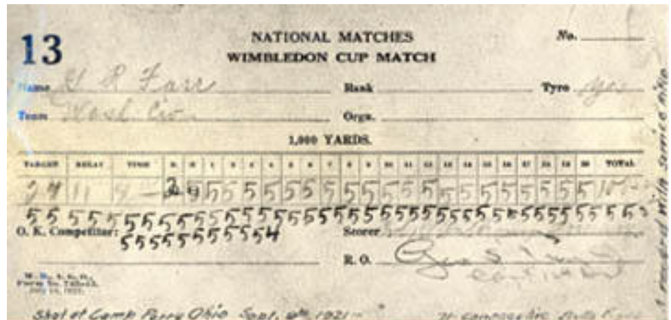
Dad Farr's Score Card

One other humorous glitch with the Farr Trophy came to light when I was attending the 2002 Nationals at Camp Perry. I was browsing the NRA Trophies in their display case late one night. While the light was none too good, and it was a bit too late for anyone to dig the trophy out for me to personally examine, I