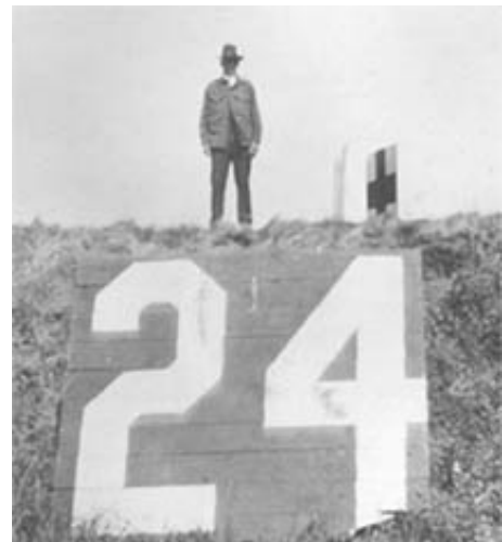
Dad Farr On 1000 Yard Butts Target #24 Where Run of 71 Straight Bullseyes were made by Dad Farr on: On Sept 9th 1921