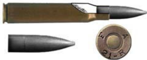
The 21-R 1921 National Match Cartridge with 180-grain flat-based tin-plated bullet

The ammunition issued at Camp Perry and fired in the 1921 National Matches was a special lot that came to be known by its nickname " Tin-Can Ammunition ". The Tin-Can Ammo was an effort by (then) Major Townsend Whelen of Frankford Arsenal to beat the metal fouling problem common to the government cupro-nickel bullet jackets on all U.S. Service Rifle Ammunition. The French had been experimenting with putting tin strips into their artillery shells in an attempt to solve the problem with large caliber weapons. It